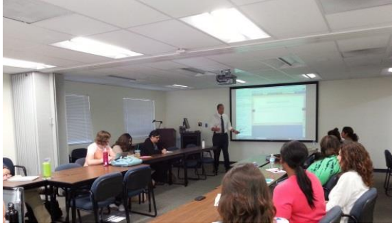
Training session for student scholars participating in long-term training grants PIs: N. Hampton and C. Sax