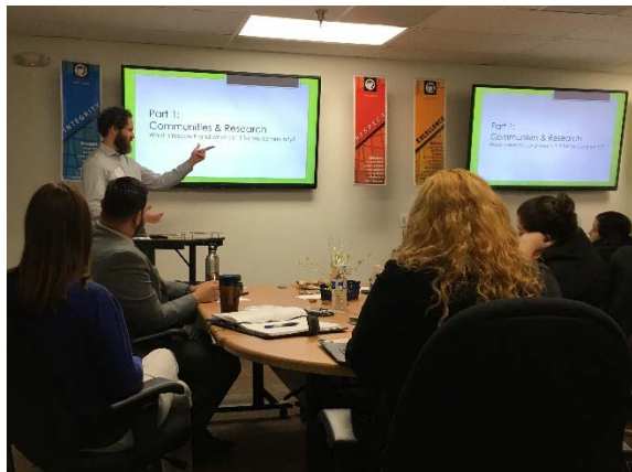
Community-based participatory research in the South Bay

University of Michigan: "Sexual and Reproductive Health for Latina Adolescents," $1,500