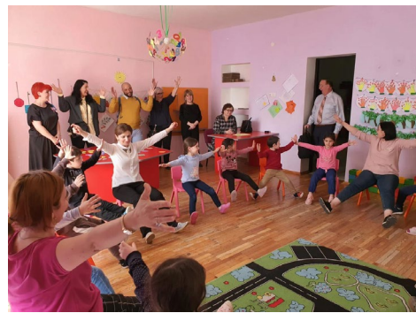
Georgian and U.S. educators and members of the ECE grant team participating in a kindergarten program in the Gori municipality of Georgia.

Government of Georgia: "Georgia 12Q - Innovation, Inclusion, and Quality: Improving Quality of and Access to Early Childhood Education Project (P168481)," $4,197,428