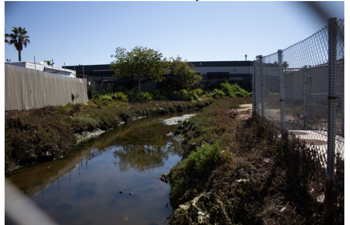
View of Paradise Creek adjacent to the Welding Shop on West 18th Street in National City. The creek is prone to flooding due to king tides and heavy rain events.